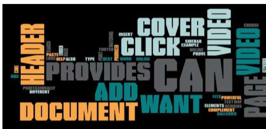
Figure 1 Pro Word Cloud image above text

To make your document look professionally produced, Word provides header, footer, cover page, and text box designs that complement each other. For example, you can add a matching cover page, header, and sidebar. Click Insert and then choose the elements you want from the different galleries.